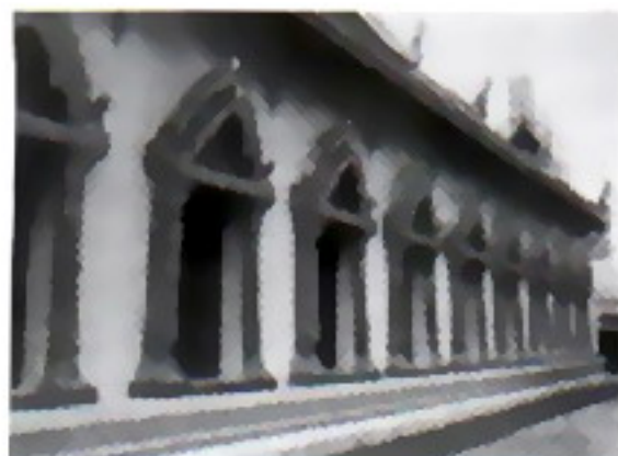
Outer wall of the ubosot with its gilded window frames.