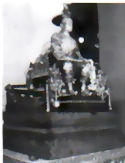
Statue of King Taksin sitting on a throne.