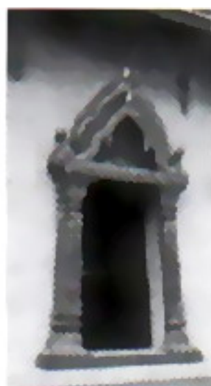
Closeup of the ubosot's window.