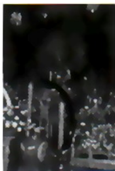
Closeup of the alter.