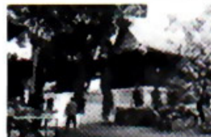
The shady lanes of the temple housing area.

Wat Chana Songkram was built in the 18 th century, the temple has recently been renovated.