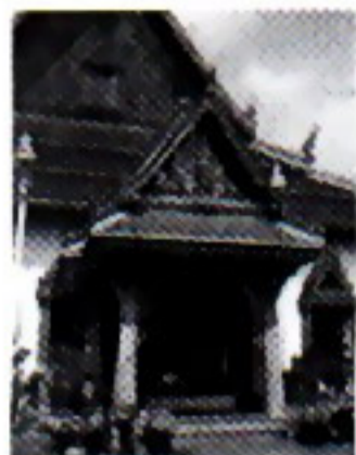
Entry to the ubosot of Wat Chana Songkram.

Tucked away in the center of the backpacker are Wat Chana Songkram is the temple of Banglumpu. People often use this temple as a shortcut between Khao San Road and the river without ever stopping to take a closer look.