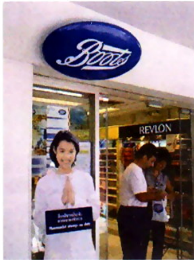
That sign says "Thanon Khaosan". Thanon means road in Thai. And the picture on the right shows the UK "Boots" chemists which is in this lane.