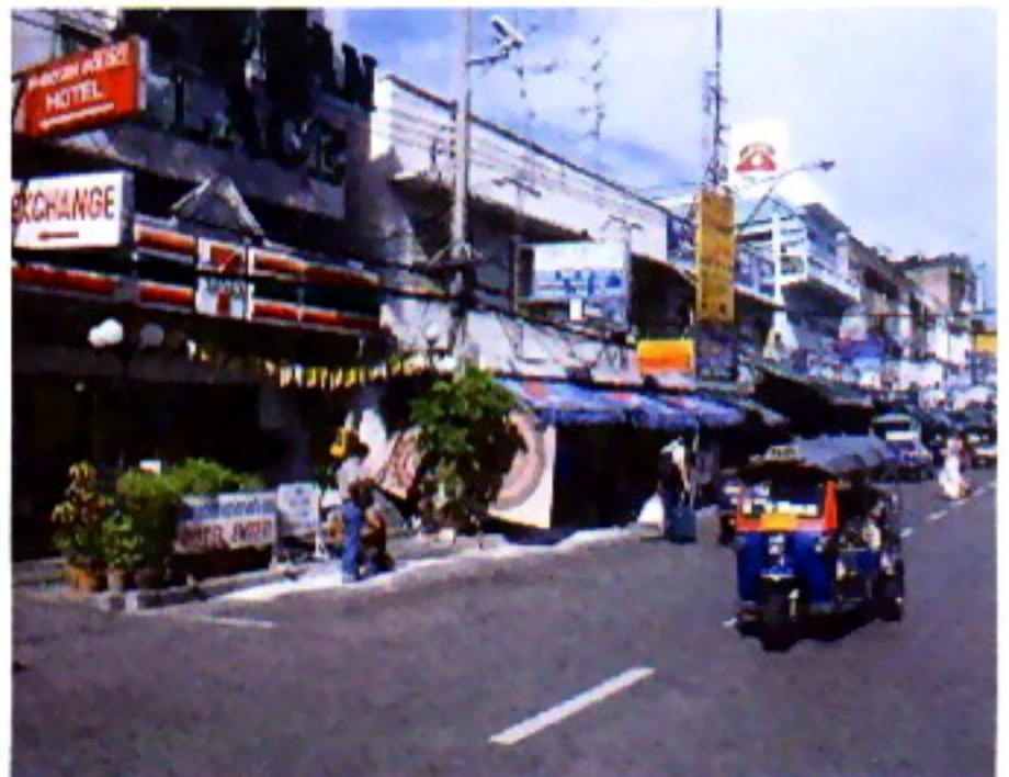
There are lots of shops here, most of them are clothes and silver shops. The picture on the right shows the 7-eleven shop and tuk-tuk. This is a three-wheeled taxi.