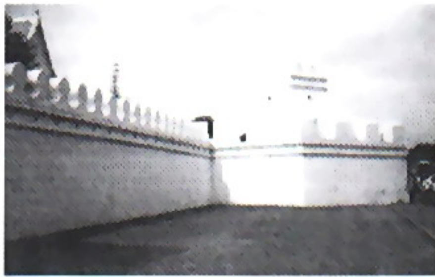
Walled with forts were constructed along the Grand Palace and Wat Phra Kaew

The city wall was built in the First reign. It spread over inner and outer of Rattanakosin Island. The city wall was constructed with 16 city gates, 47 small gates or in Thai calls "Chong Kud gate" and 14 forts at intervals along it. The city wall seen today locates in three places that exist in the city. First of all, the city wall that was constructed along the Grand Palace and Wat Phra Kaew.