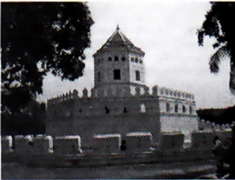
View Suntichaipakran Fort from the Chao Phraya River

The forts that were constructed at intervals with the city wall have 14 forts. There were Phra Sumain, Yukornton, Mahaprab, Mahakan, Mootaluog, Seurtayan, Mahachai, charkphet, Phisua, Mahaluok, Mahayak, Phrachun, Phra-Ar-thit, and Isintorn. Nowadays, they still remain two forts. They are Mahakan Fort and Phra Sumain Fort or now it was named Suntichaipakran Fort (December 5, 1999). Suntichaipakran Fort was restored by Fine Arts Department in 1981.