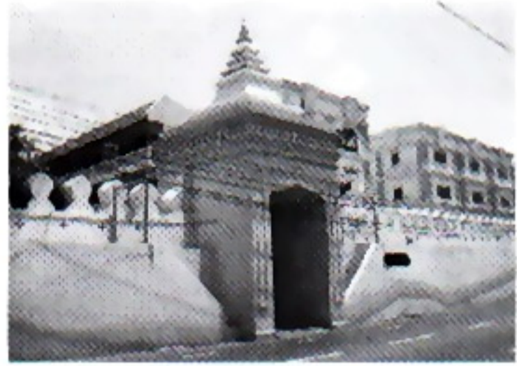
The Ancient City Wall and City Gate

The city gate that exists in the city when it was built in the First reign did not look like the restored one but it used to be the name of timber with red color paint. The present gate was resorted after the gate that was built in the fifth reign (1868-1910)