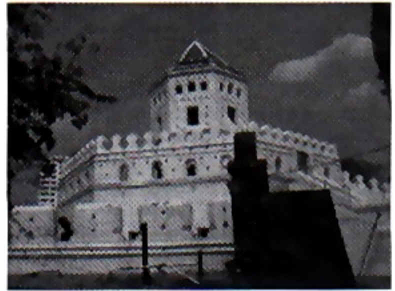
View Suntichaipakran Fort from Phra Arthit Road