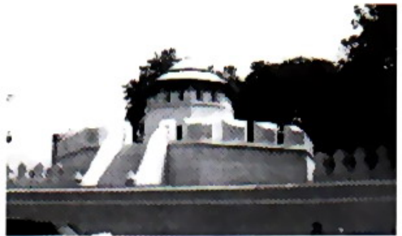
View Mahakan Fort at Ratchadamneun Klang

Finally, the city wall that opposite Bovonnivet Vihan Temple. This wall was constructed with the city gate that is only one gate remain (out of sixteen gates).