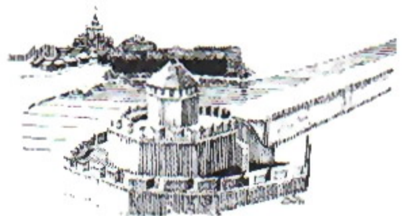
View of other broken forts