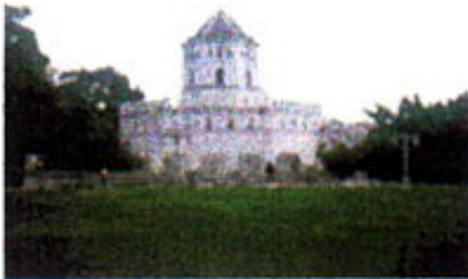
PRA SUMANE FORT AT BANG LAM PHU