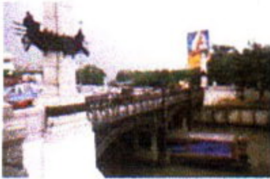
Pan fa lee las bridge