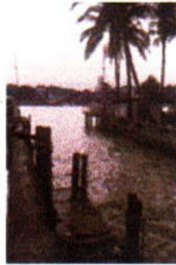
The end of Klond Robb Jrung at Prabuddhayodfa bridge