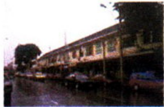
BUILDING : Europe style