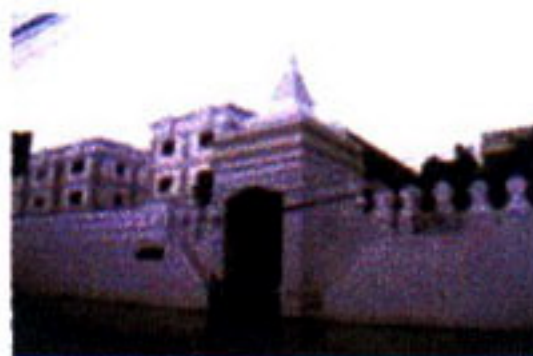
Remaining city wall at Wat Bowonniwet