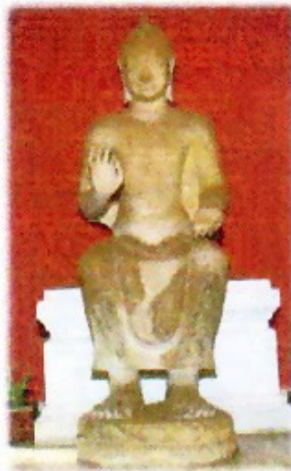
Sitting Buddha on the throne in Attitude of preaching, Dvaravati style 6-9th century A.D.