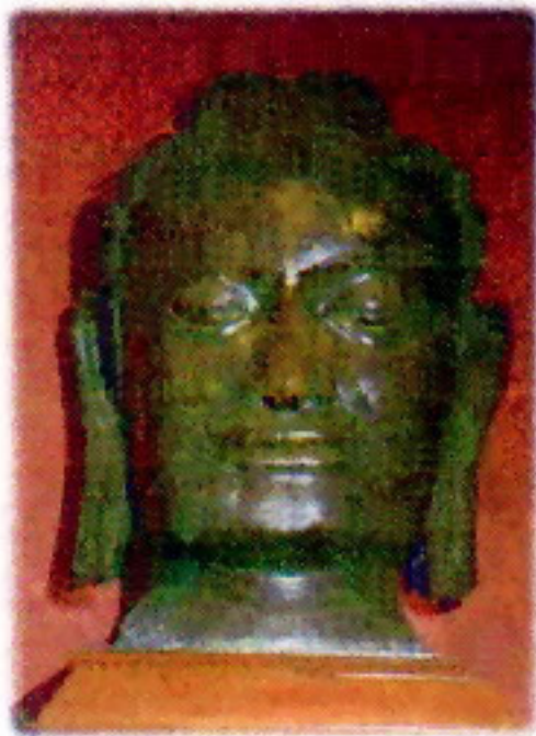
Head of Buddha, Bronze U-Thong style, 13th century A.D. from Wat Dhamsarak, Ayutthaya

The ground floor contains all of the ancient art objects which were found during the great excavation in 1956-1957. Most of these are Buddha images of different styles-Dvaravati, Lopburi, U-Thong, and Ayutthaya. The earliest Buddha image which was found in this area and displayed in the building is the white stone Buddha image in the attitude of preaching, Dvaravati style. The most beautiful and the most original Thai artistic expression is seen in the Buddha image in subdumprana, Sukhothai style. The most beautiful woodcarvings of the Ayutthaya period are also displayed. Such as the door panel showing divinites holding the swords, dyarapala from the niche of stupa at Wat Phra Si Sanphet, Phra Nakorn Si Ayutthaya.