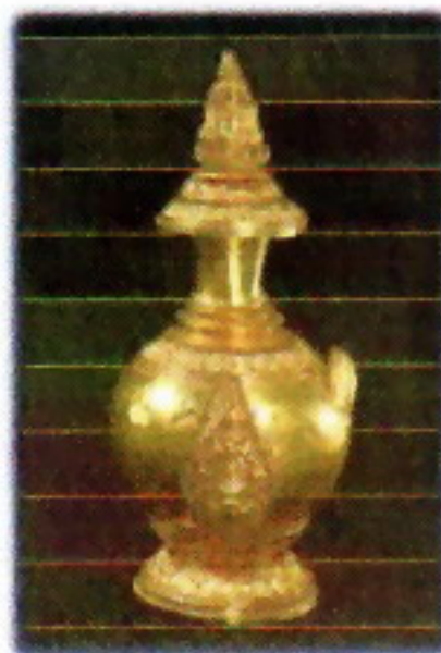
Gold water vessel with Brahma's faces on the lid.

Ayuthaya style, 15th century A.D. from the crypt of the main prang at Wat Ratchaburana