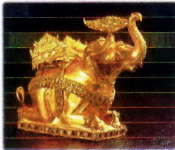
Carapisoned crouching elephant, gold encrusted with precious stones.

Ayuthaya style, 15th century A.D. from the crypt of the main prang at Wat Ratchaburana