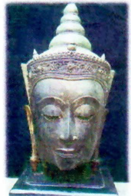
Head of Crowned Buddha, Bronze Ayutthaya style, 15th century A.D.

The first floor, The ancient golden objects found in the crypts of the main prang at Wat Ratchaburana are exhibited in one security room. A unique and very fine piece is the royal sword and scabbard, gold, decorated with precious stones. Another room contains Buddha relics found in the main stupa at Wat Mahathat. Lead and terra cotta Buddhist votive tablets of Sukhothai, Lopburi, and Ayutthaya style which were found at Wat Ratchaburana, Wat Mahathat, Wat Phra Ram are exhibited in the cases along the inner porch.