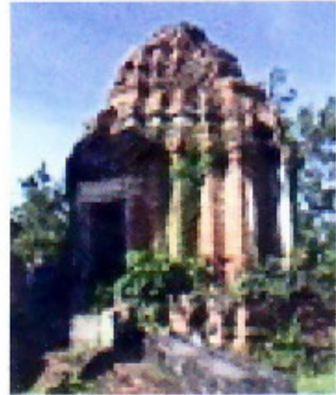
A mondhop contain the Buddha statue Phra Si Ariya Metrai