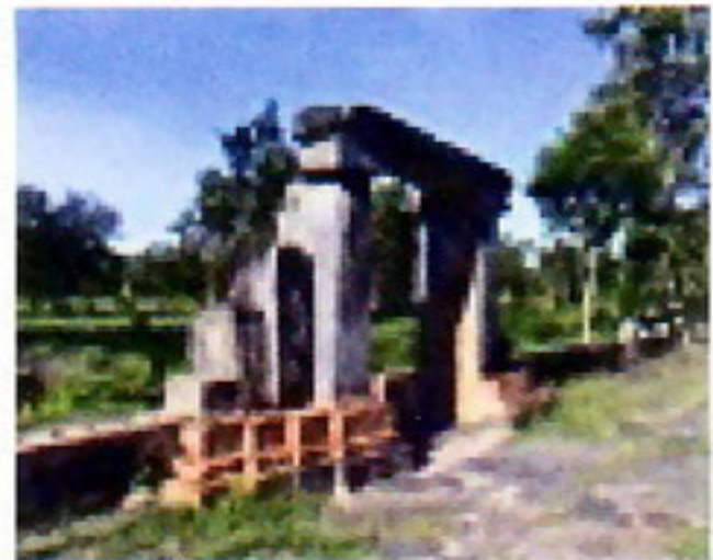
The door of Mondhop