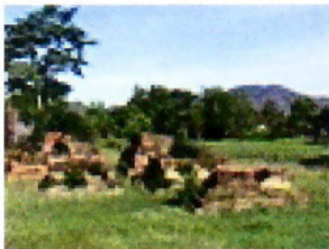
Bases of the small Chedis